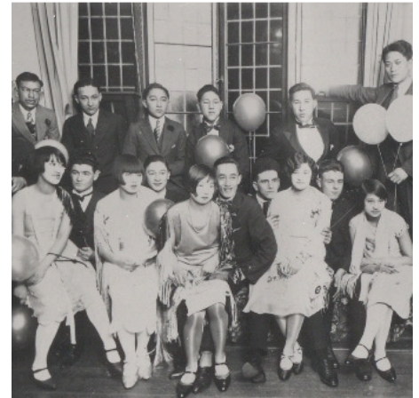
Unidentified group 1920s

If you or someone you know has Chinese ancestry and can remember life in the 1930s we would like to hear from you. All information will be kept confidential and in the first