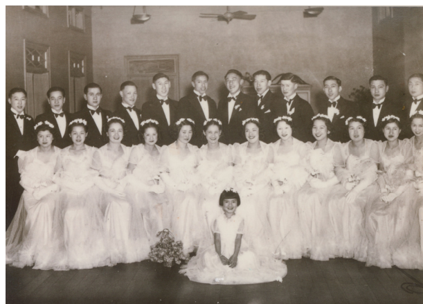
YCL debutantes 1938